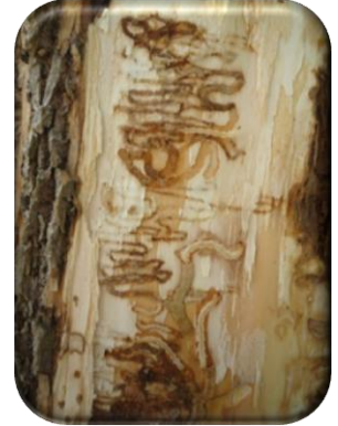
"S" shaped tunnels under the bark