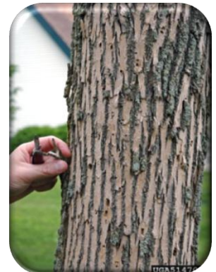
Excessive woodpecker activity

Verify Your Tree: Emerald Ash Borers only live and feed on ash trees. Look up the characteristics of ash trees at Cornell's woody plant database. http://woodyplants.mannlib.cornell.edu/