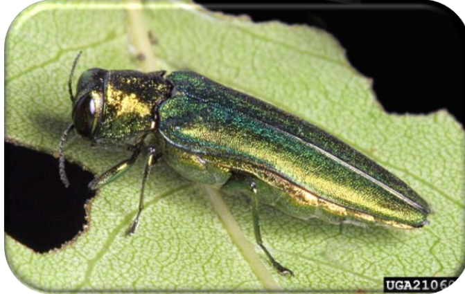
Small, 1/2" metallic green beetles