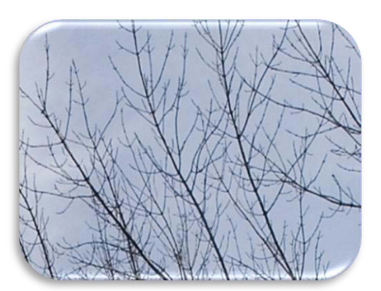
Opposite Branch Arrangements Buds, Leaves and Branches are directly across from one another