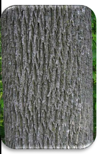
<u>Diamond Patterned Bark</u> Ridges and furrows form diamond shapes in older bark (green & white ash)