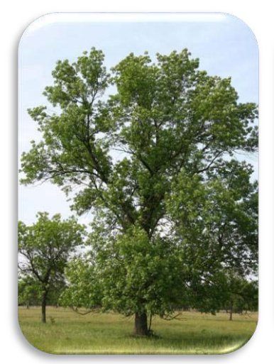
Trees have an Upright, Oval Shape