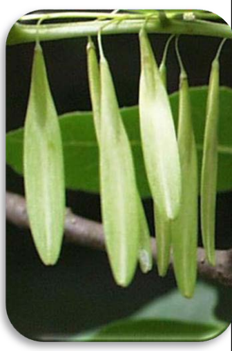
Single Samara Fruit Seed surrounded by a dry, oar shaped wing