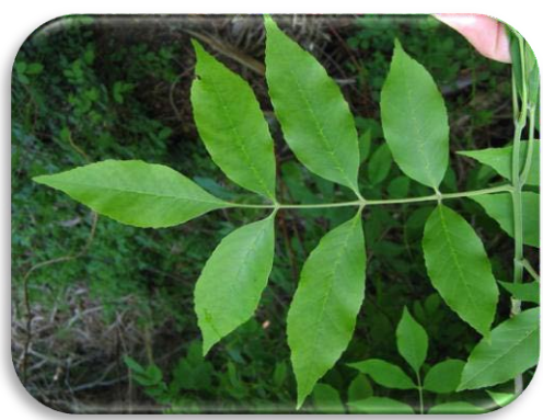
Pinnately Compound Leaves Leaf made of leaflets arranged in a line with one terminal leaflet. 5-11 leaflets per leaf