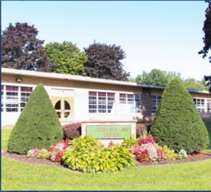
Christ the King