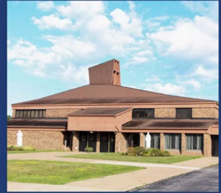
Pope John XXIII