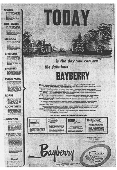
Syracuse Herald Journal July 4, 1956

For more information on the early years in the community, check out the Bayberry video at the Liverpool Public Library. In May 2017, the BCA will celebrate 60 years of neighbors working together solving common problems, reaching common goals.