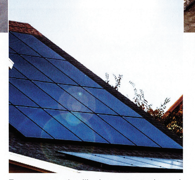
Energy upgrades like hot water tanks and solar panels qualify for this program!

You can't control the weather, but you can prevent costly weather-related damage to your home.